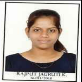
RAJPUT JAGRUTI K. 16/01/2018