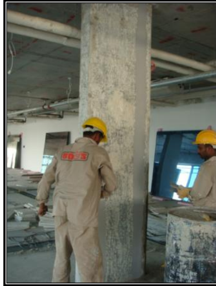
Application of Adhesive for Laminate.