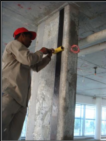
Installation and Rolling / Pressing of CFRP Laminate.