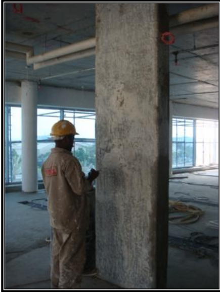
Surface Preparation using Grinder & Putty to remove irregularities.