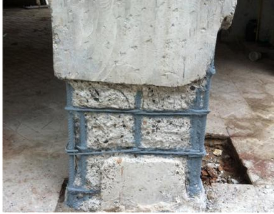
TYPICAL IMAGE OF SURFACE PREPARED RCC MEMBER