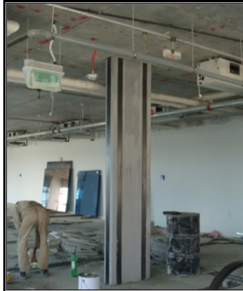
COMPLETED CFRP LAMINATES INSTALLATION.